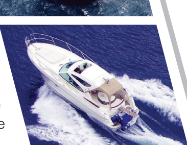
Complete Line of Marine Transmissions - Electric Shift Available on Most Models

The Velvet Drive® transmission brand has been a leader in the marine industry for over 50 years. Regal has manufactured, and has been the exclusive source of, Velvet Drive transmissions since 1996. Velvet Drive transmission products feature quiet, smooth operation and are manufactured using the highest quality industry standards. Applications include tournament ski boats, inboard cruisers, sport fishing boats, sailboats, trawlers, center consoles, runabouts, yachts and high performance boats. The Liberty Series™ transmission provides the marine enthusiast the most power density transmission available, offering more horsepower per cubic inch of space, freeing up more usable boat space where it counts.